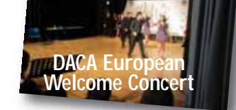
DACA European Welcome Concert