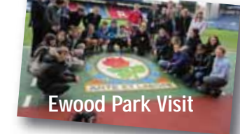
Ewood Park Visit