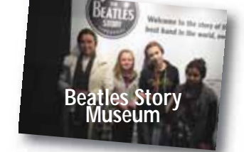
Beatles Story Museum