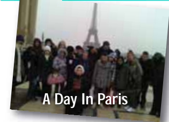
A Day In Paris