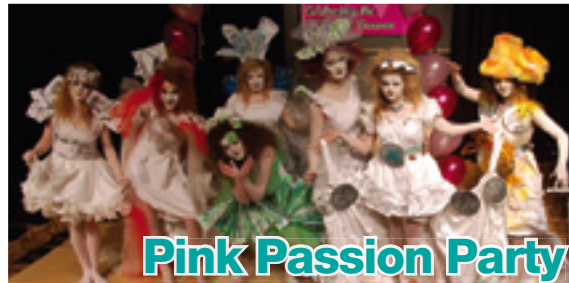
Pink Passion Party