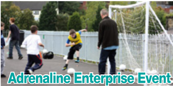
Adrenaline Enterprise Event